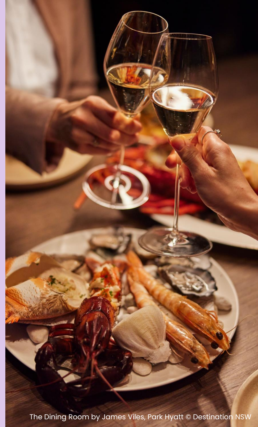
The Dining Room by James Viles, Park Hyatt

Sydney might be relaxed but it is serious about its food and drink. It has a dedicated coffee culture , commitment to brunch, and a range of great bars and restaurants – from the affordable to the flash – with cuisine that spans Asian-fusion, fresh seafood, modern Australian, and European and Middle Eastern cuisine. In the inner city, popular dining districts include Barangaroo – our newest waterfront precinct with fine dining options – Chinatown , Chippendale , Potts Point and Surry Hills . In the CBD, you can also find YCK Laneways , a buzzing late-night precinct with small bars, dining and entertainment.